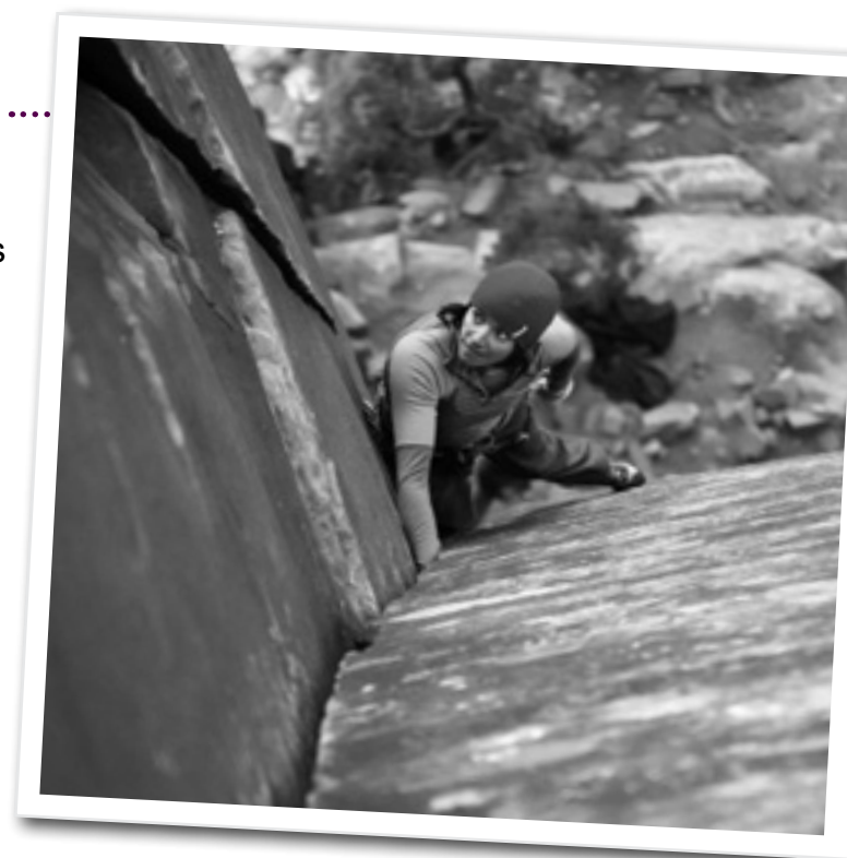
Quinn Brett climbs big walls in Yosemite, Zion and Greenland. (see August 12)

SEE CALENDAR LISTINGS FOR DETAILS starting on page 6